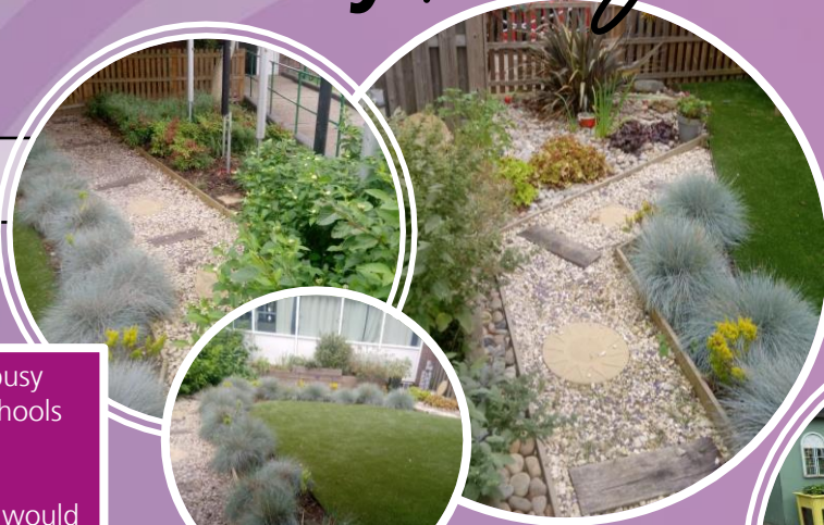
Refresh of Cranford Primary School's Sensory Garden

Our Community Rangers have been busy helping out local communities and schools with a variety of projects.