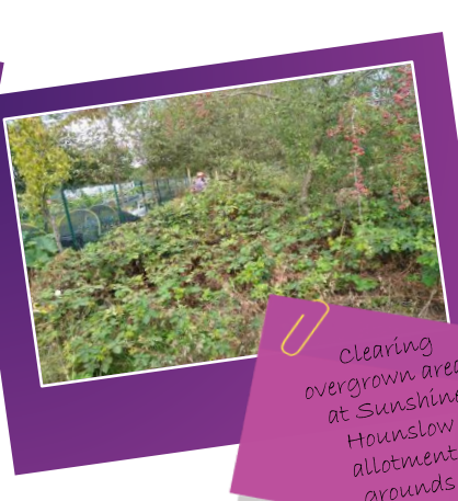
clearing overgrown areas at Sunshine Hounslow allotment grounds