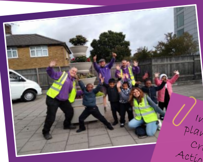
Installing planters with Cranford Action Group and Cranford Primary School