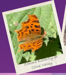
Comma Butterfly at Colne valley

Summer is a time for lots of surveys! We survey all sites to ensure we are managing their habitats in a way that is beneficial for biodiversity. We survey for grass snakes, butterflies, moths, birds, orchids, solitary bees & wasps, and bats.