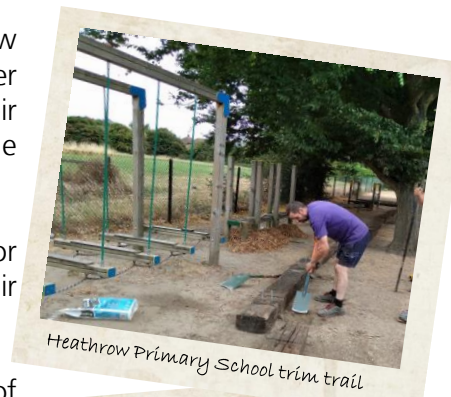
Heathrow Primary School trim trail

Pippins Primary School benefitted from a painting refresh of some of its corridors and a classroom.