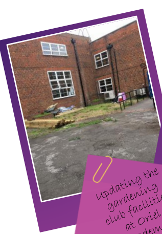
Updating the gardening club facilities at Oriel Academy, Feltham