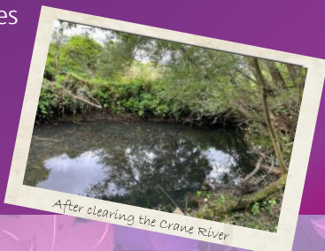
After clearing the Crane River