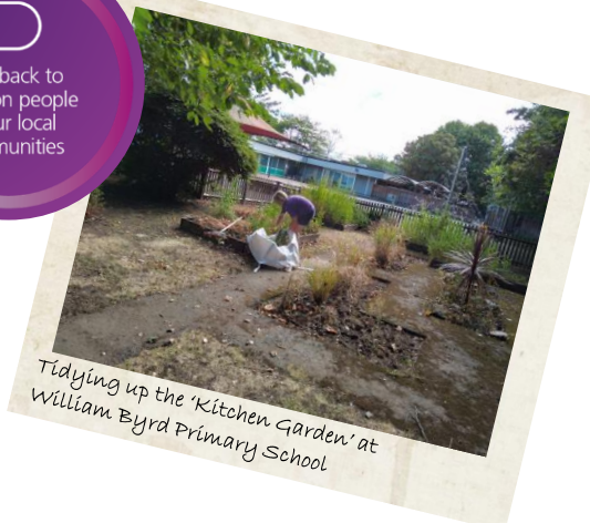
Tidying up the 'Kitchen Garden' at William Byrd Primary School