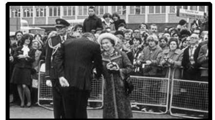
1977: HM Queen Elizabeth II visits Heathrow to open the Piccadilly Line extension

On the day of the funeral we arranged with our stakeholders for all non-essential retail to be closed and the State Funeral was shown on screens across our terminals, which allowed everyone to view the funeral procession, service and ceremony.