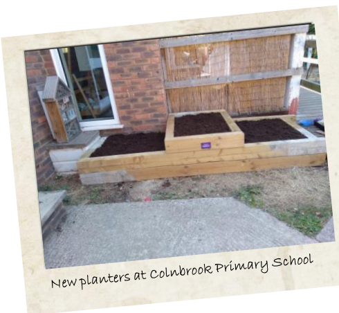
New planters at Colnbrook Primary School