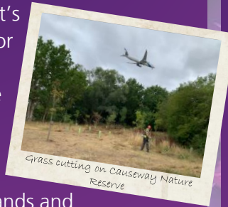
Grass cutting on Causeway Nature Reserve

Towards the end of the summer and once all the wildflowers have started to seed, it's time for us to ensure all the wild flower grasslands and meadows on the sites are cut and all cuttings are removed from the area. We need to ensure that all the cuttings are removed so the grassland doesn't receive too many nutrients. Wildflowers thrive in a habitat with poor nutrient soil, so removing any cuttings helps future establishment.