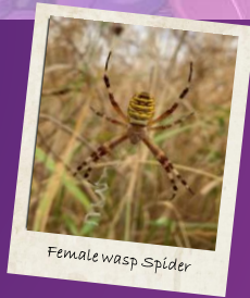
Female wasp Spider

Easily recognised with distinctive yellow and black striped body markings, we have them on a few of our Biodiversity sites, even on some of the public access ones. They are harmless to humans and feed mainly on grasshoppers but beware if you are a male Wasp Spider. He is a fraction of her size and after mating she will eat him, as he is precious protein to help rear her young.