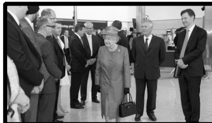
HM Queen Elizabeth II at the Opening of Terminal 2: the Queen's Terminal