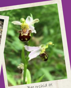
Bee orchid at Princes Lake