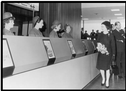
1969: HM Queen Elizabeth II tours Terminal 1

The world has lost an irreplaceable and very special person.