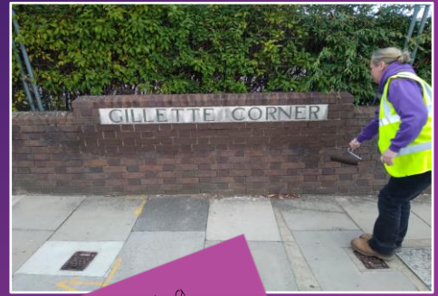
Supporting councils with covering up graffiti and litter picking ahead of HM Queen Elizabeth's funeral procession