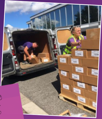
Delivering surplus food to food banks