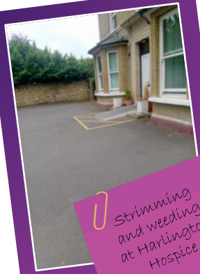
Strimming and weeding at Harlington Hospice