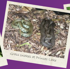
Grass snakes at Princes Lake