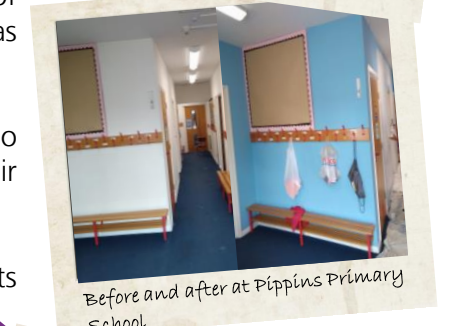
Before and after at Pippins Primary School